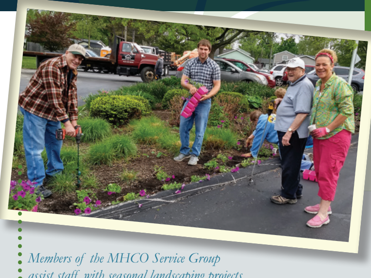
assist staff with seasonal landscaping projects.

Four enterprising PG students from Mrs. Schroeder's class have adopted Channel 2, Hilty's closed-circuit TV channel. The residents can now view updated weather and Hilty news on their own television station.