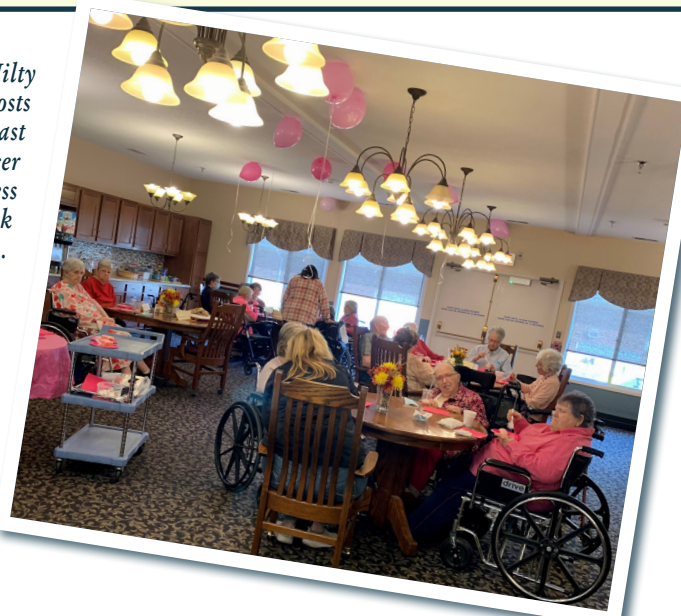
Hilty Home hosts a Breast Cancer Awareness Pink Party.